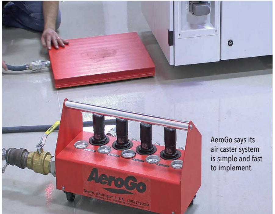
AeroGo says its air caster system is simple and fast to implement.